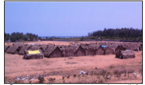
Grass hut villages constructed as relief housing for tsunami victims.

DERA also toured some of the relief housing that had been constructed for the fishermen to the north of Chennai.