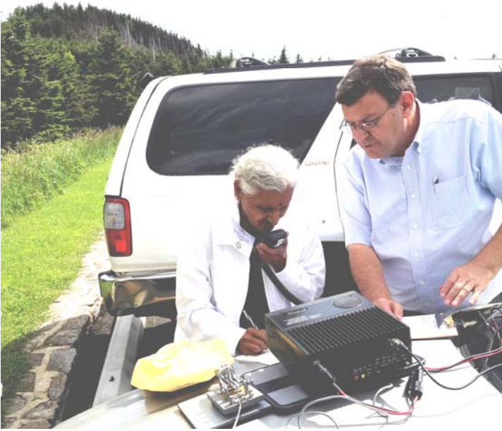
VU2BL and K5PF Operating N4D on 20 Meters Radio Field Exercise at Mount Mitchell