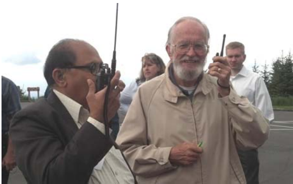
VU2MY and WD4CNZ Operating N4D on Two Meters and 440 MHz